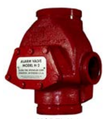
MODEL H-2 GROOVE/GROOVE