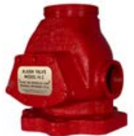
MODEL H-3 FLANGE/GROOVE