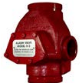
MODEL H-2 GROOVE/GROOVE