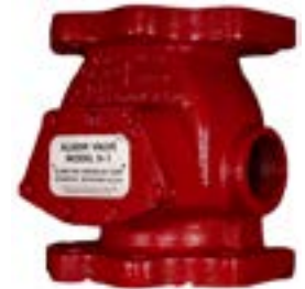
MODEL H-1 FLANGE/FLANGE